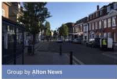
Group

Thank you again everyone, we are so proud of the way the children have adapted to the changes with entrances/collection points, separated playgrounds and toilets and year group assemblies (with humming and miming to our songs, instead of singing) – it's all pretty much embedded now. Hot school dinners are a great success, with a brilliant uptake. They look delicious too!